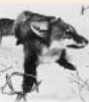
... trapped ...